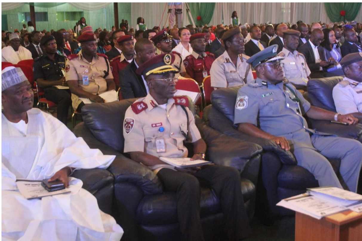
Cross-sectional view of the delegates @ the Opening Ceremony of eNigeria 2017