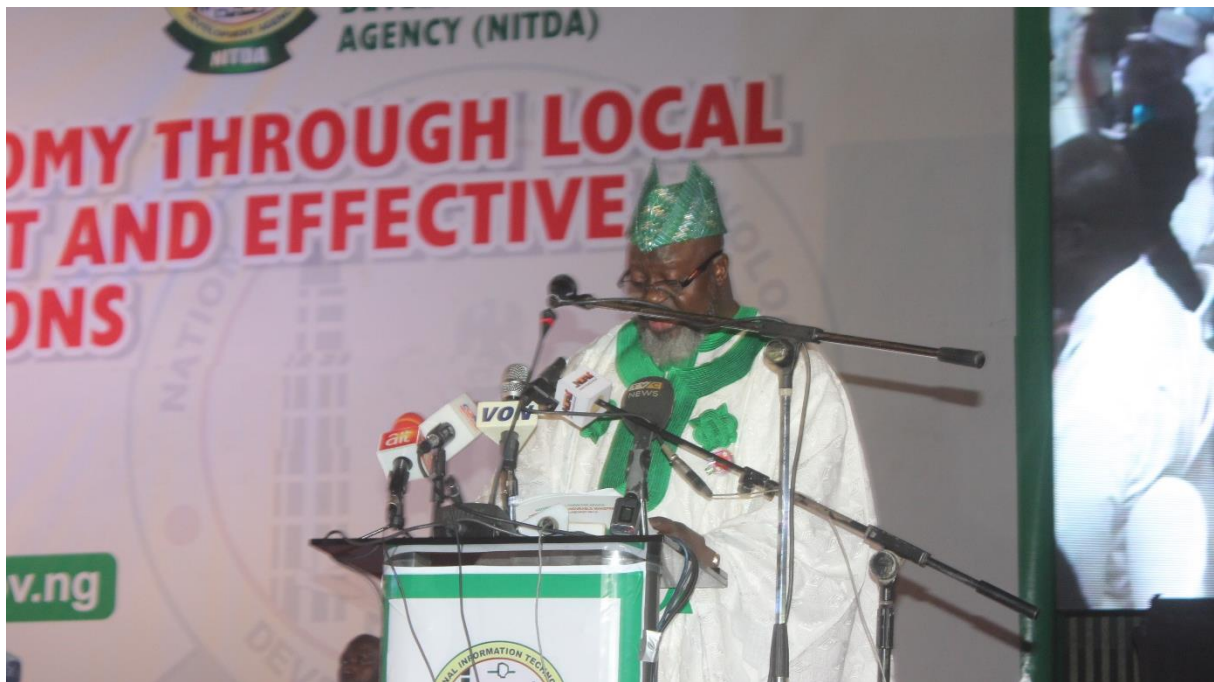
Goodwill message from Barr. Shittu Adebayo, Hon Minister of Communications @ the Opening Ceremony