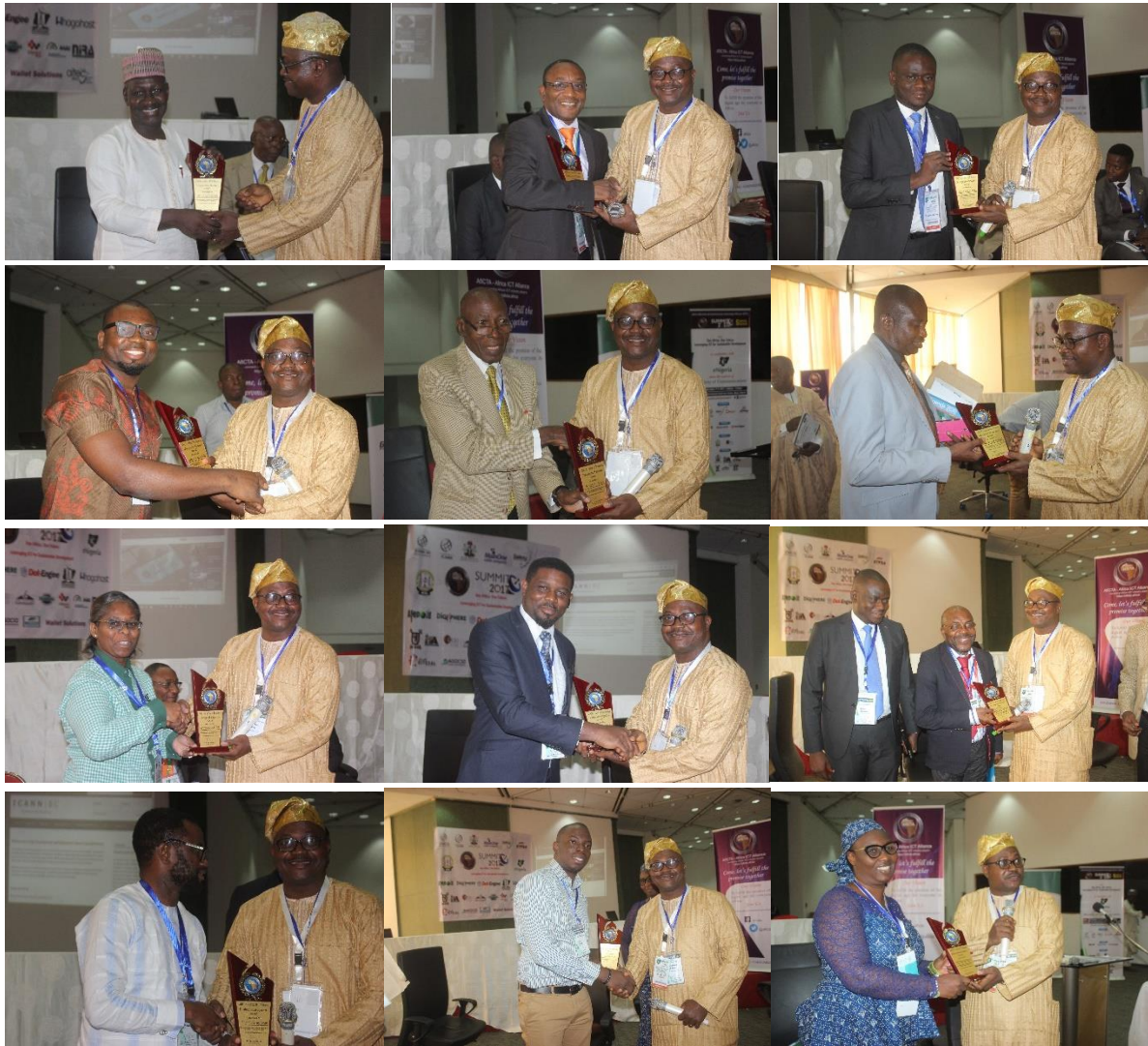
Presentation of Distinguished Speaker Award to Speakers for valuable speaking and knowledge impacting role at the Summit