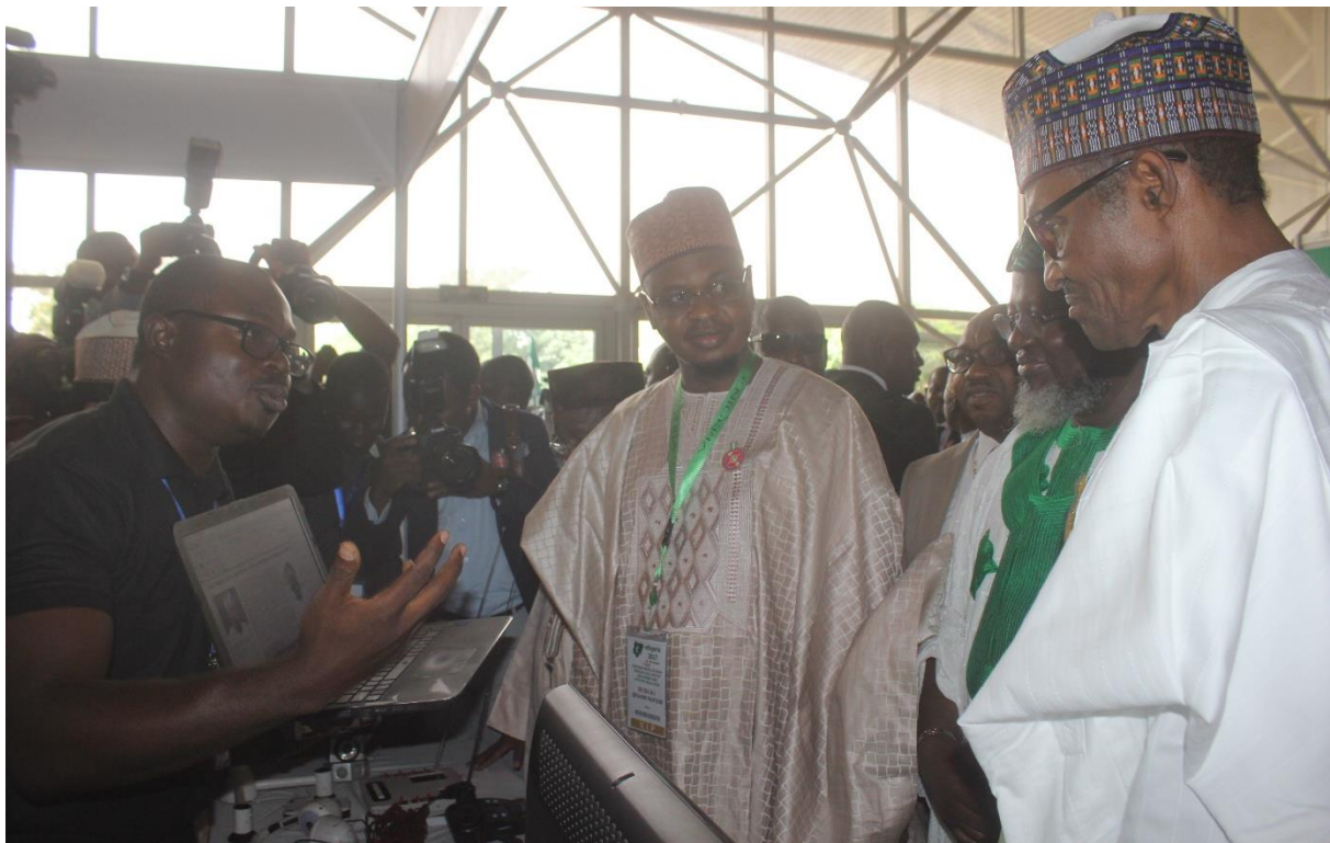
President Mohammedu Buhari @ the Exhibition booth inspecting the Local Solutions by Startups