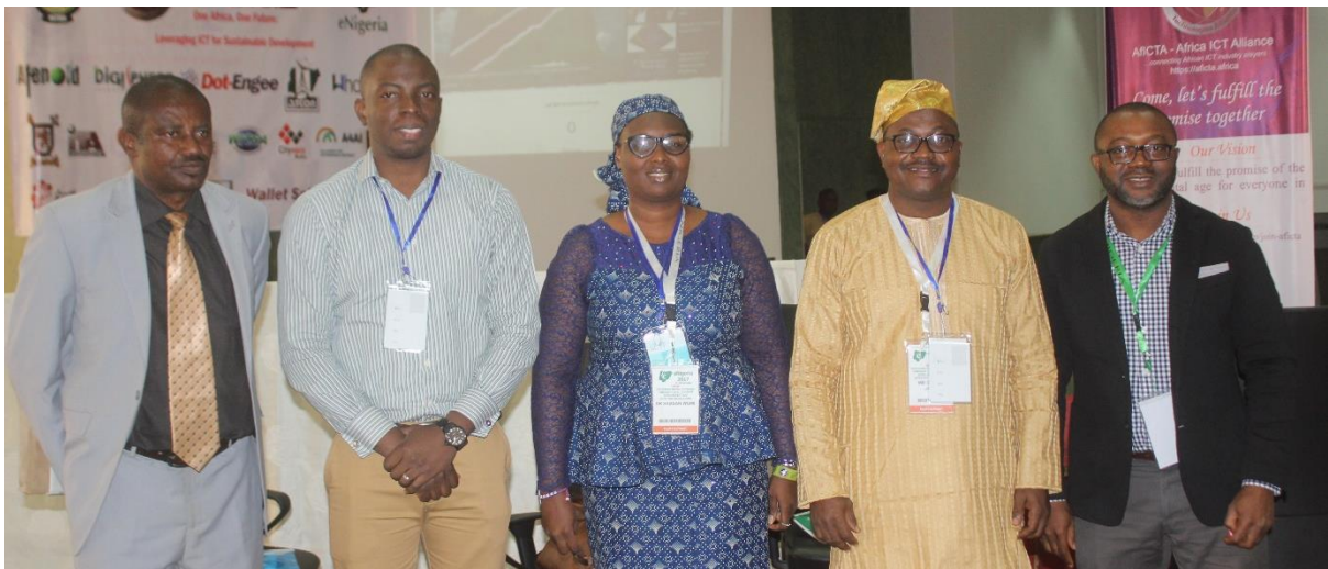
Panel Discussants on High Level Panel on Leveraging ICTs for Sustainable Development eSolutions @ ePayment...