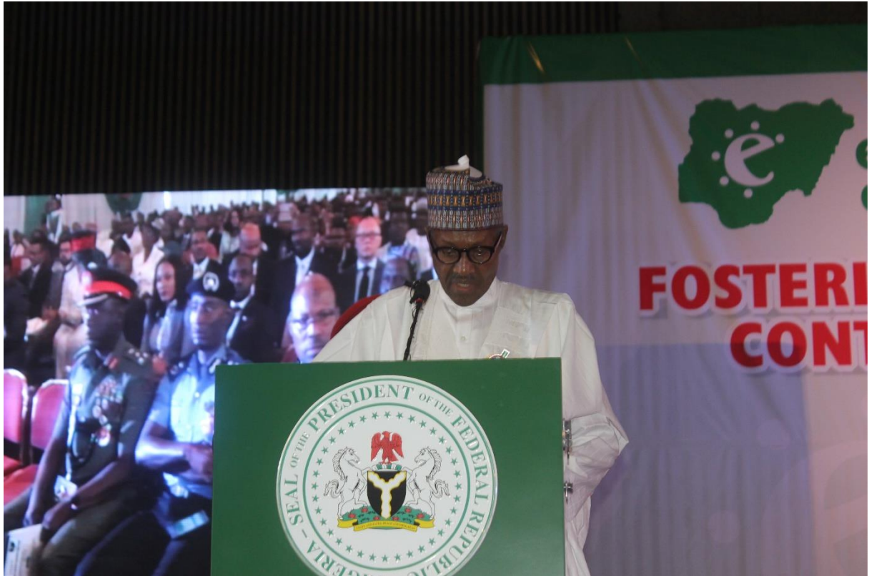
President Mohammedu Buhari Speech delivery and Official Opening of eNigeria 2017