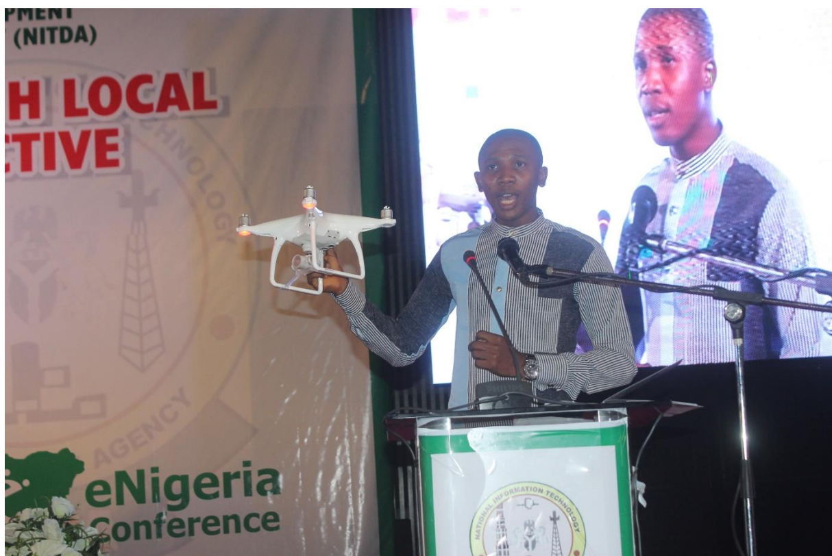
Startup Innovative Pitch on e-Agriculture