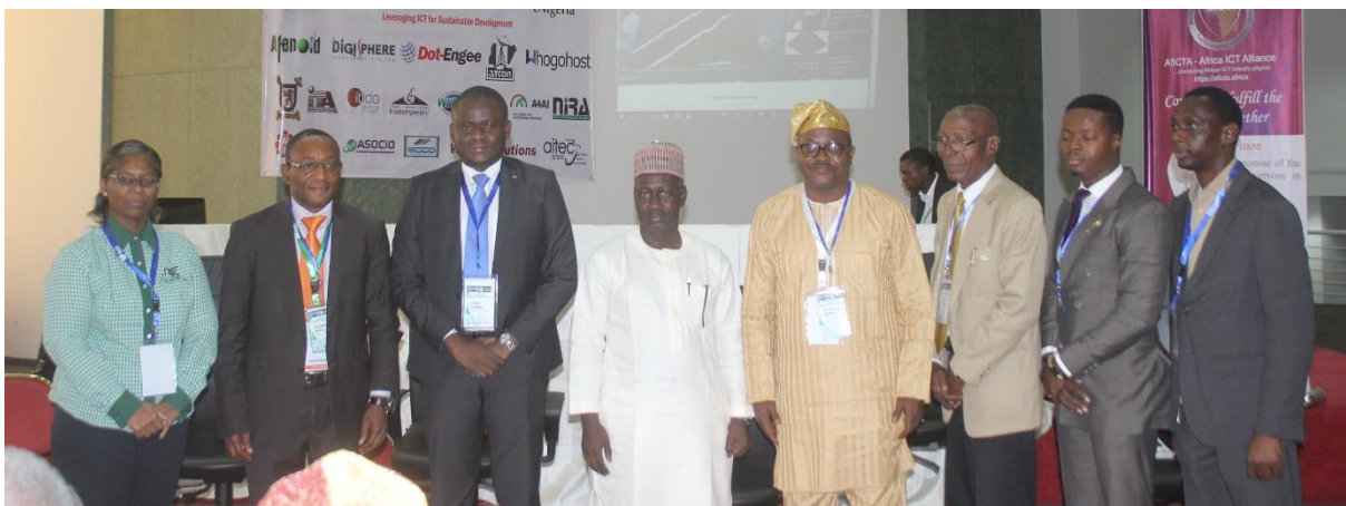
Panel Discussants on High Level Panel on Building One Future and One Network for Africa