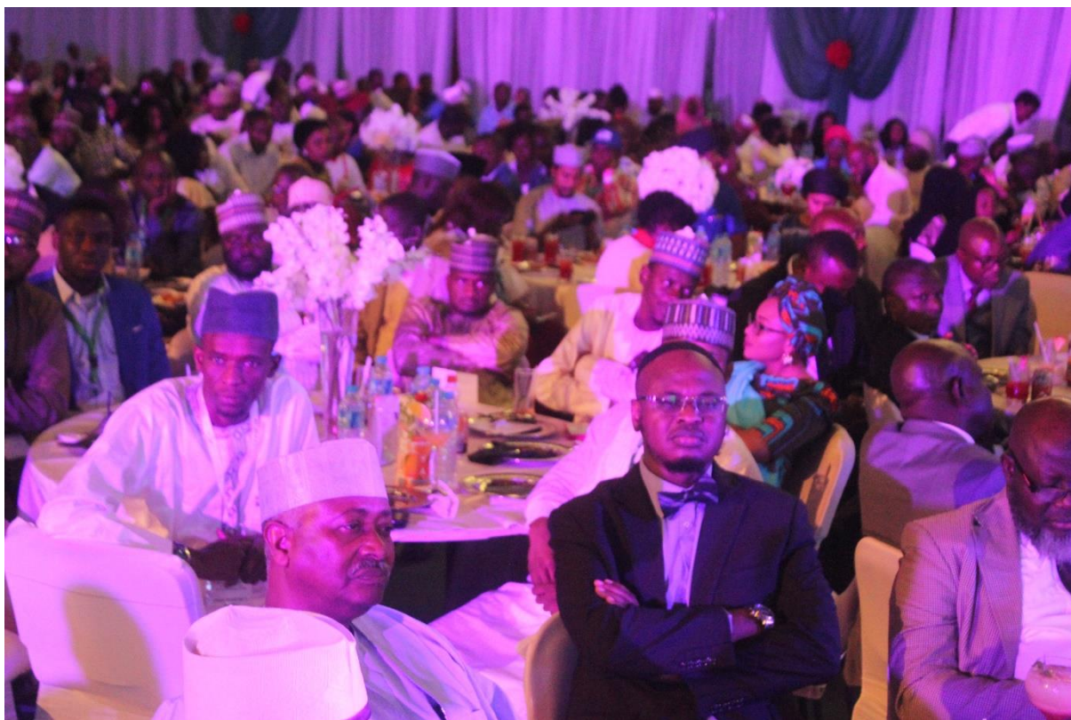
eNigeria Night of Award