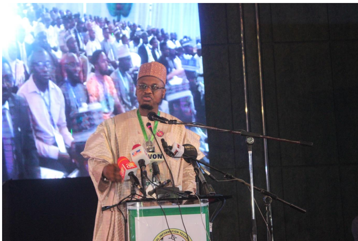
DG NITDA Dr Isa Ali Ibrahim (Pantami) during the Opening Ceremony