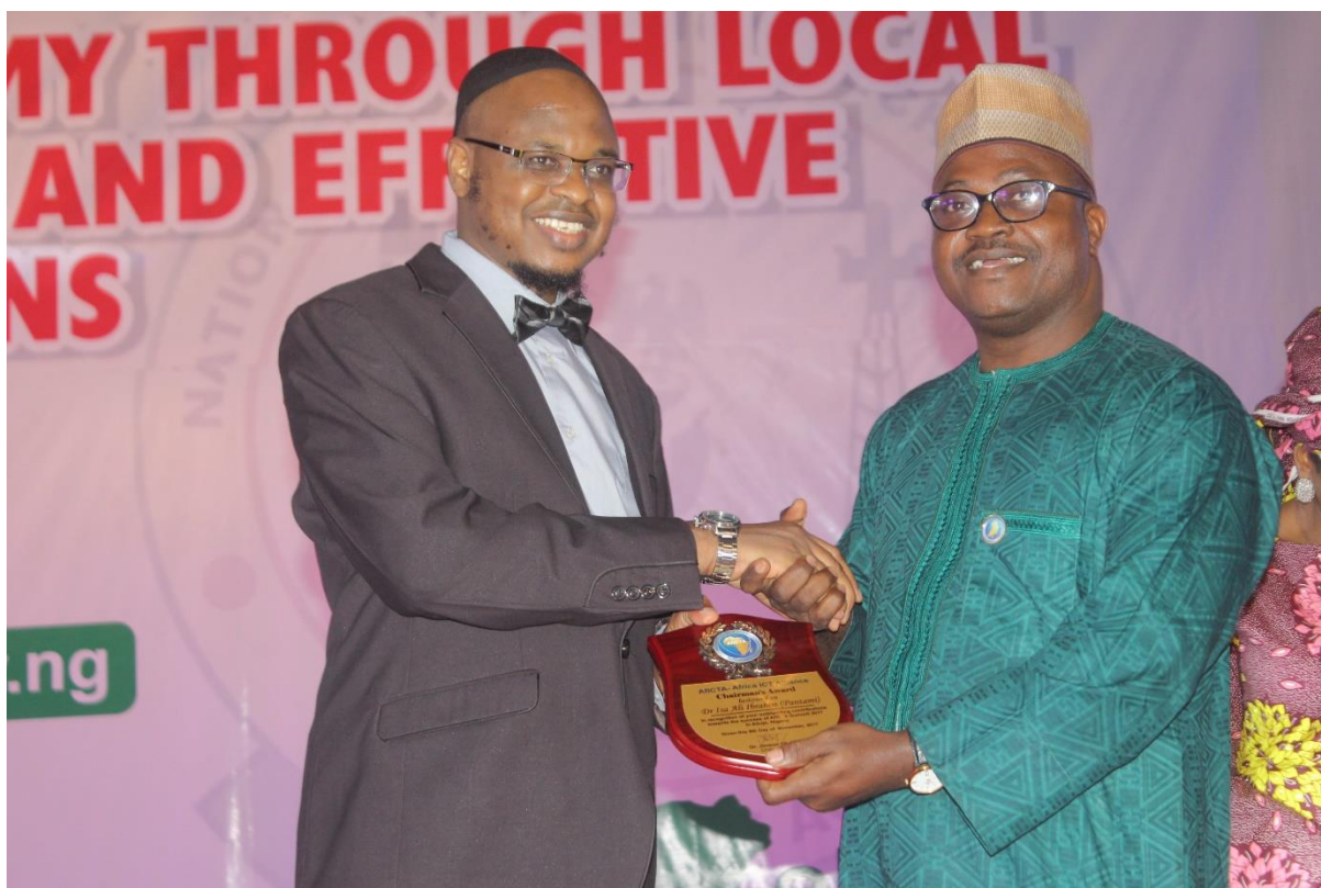
Chairman's Award to DG NITDA, Dr Isa Ali Ibrahim (Pantami)