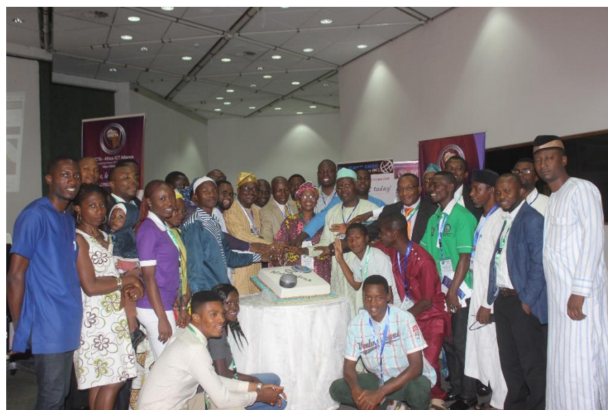
Celebrating AfICTA migration to dot Africa