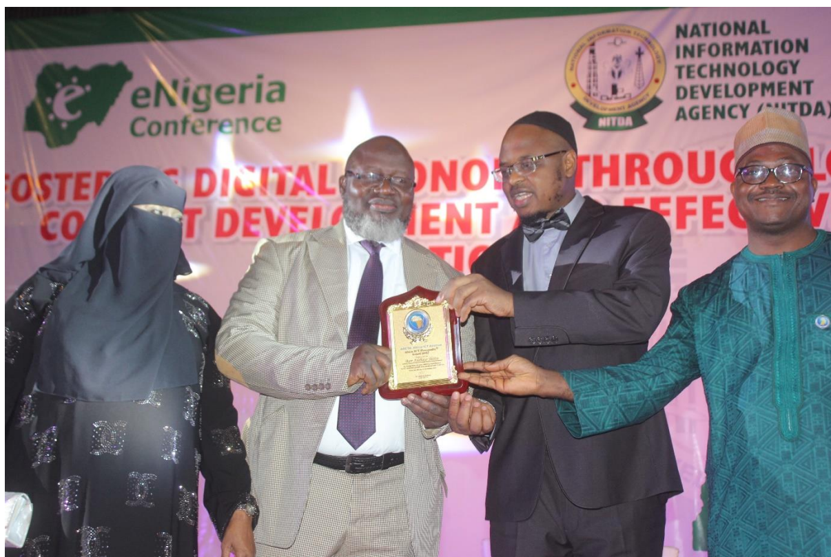
Africa ICT Champion Award Presentation to the Hon. Minister of Communications, Barr. Adebayo Shittu