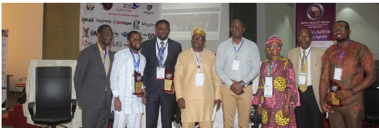
BC-ICANN Outreach Session Discussants