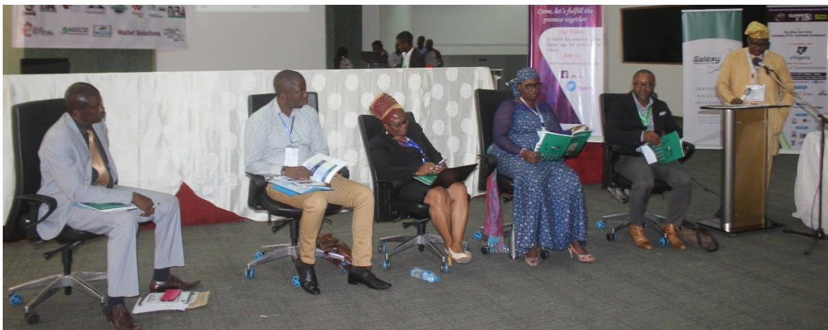
Panel Discussants of High Level Panel on Leveraging ICTs for Sustainable Development eSolutions @ ePayment...