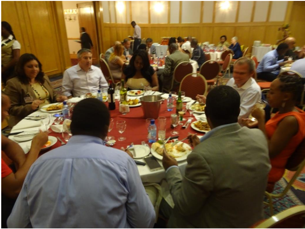
Summit participants at the buffet cocktail