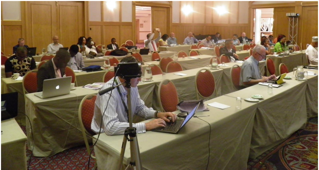
A cross-sectional view of Summit participants during SDG and Cyber security session