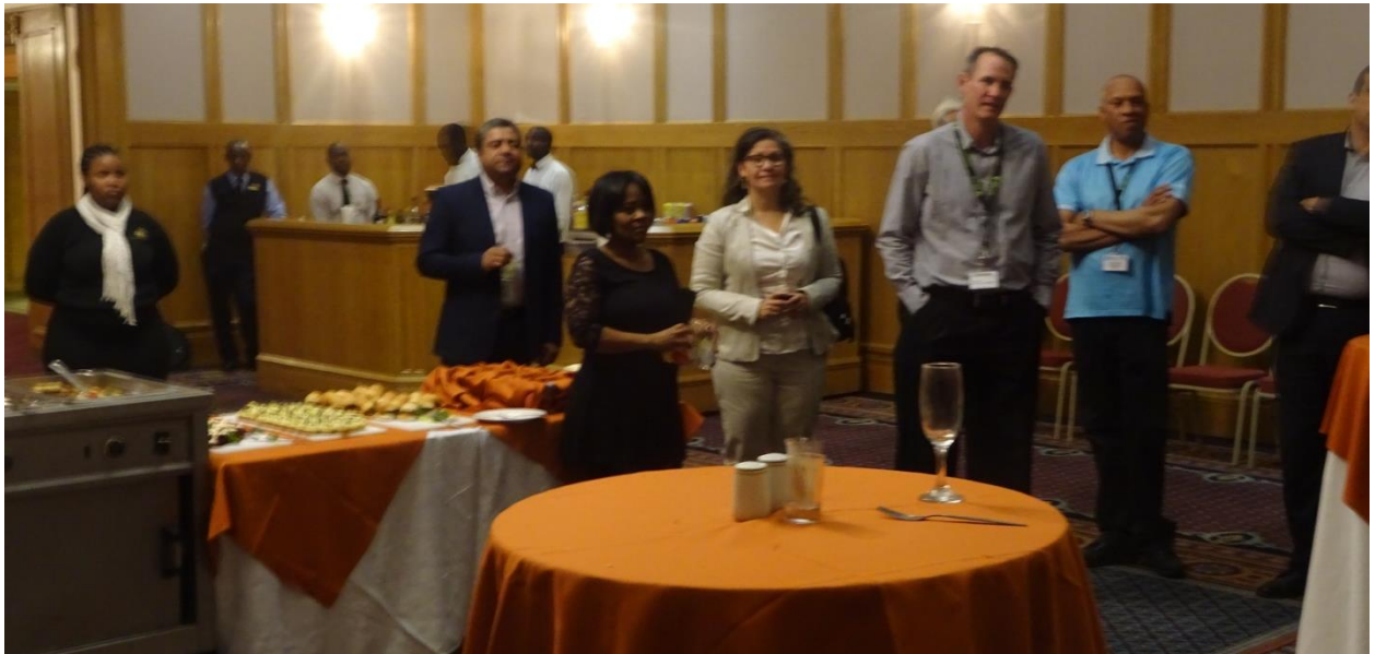
Summit delegates during welcome cocktail