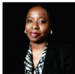
Funke Opeke Nigeria