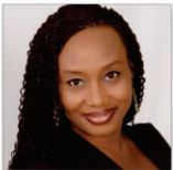
Phil Okoroafor Nigeria