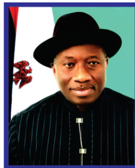
His Excellency DR. GOODLUCK EBELE JONATHAN, GCFR President and Commander-In-Chief of the Armed Forces Federal Republic of Nigeria