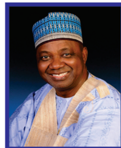
His Excellency ARC. NAMADI SAMBO, GCON Vice-President, Federal Republic of Nigeria