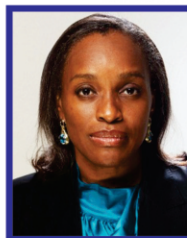
Mrs. Omobola Johnson Minister of Communication Technology