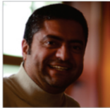
Hossam Elgamal Egypt